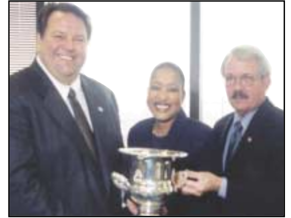
Georgia Merit System (101 to 500 employees)