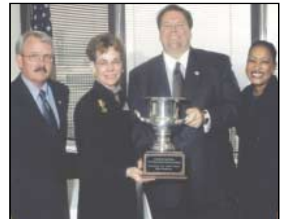
University of Georgia (9001 and up employees)