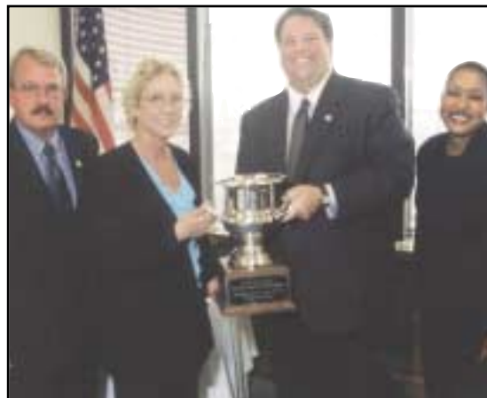
Georgia Institute of Technology (1001 to 9000 employees)