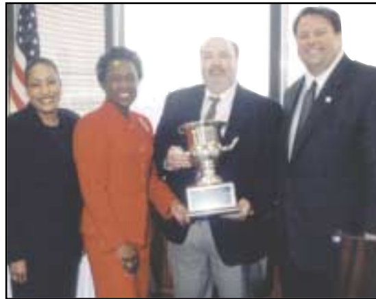
Georgia Student Finance Commission (1-100 employees)