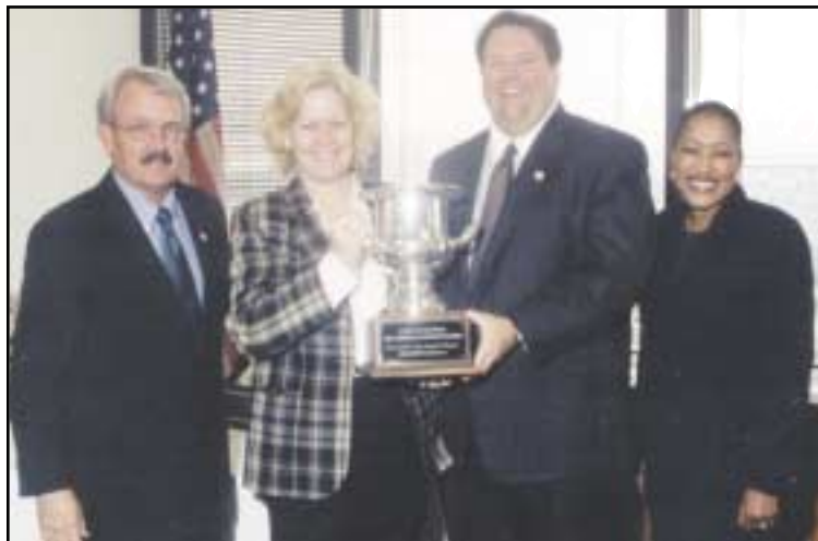
Georgia College and State University (501 to 1000 employees)